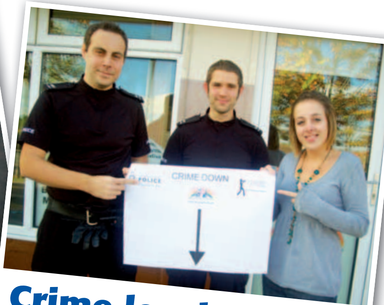
Crime levels DOWN